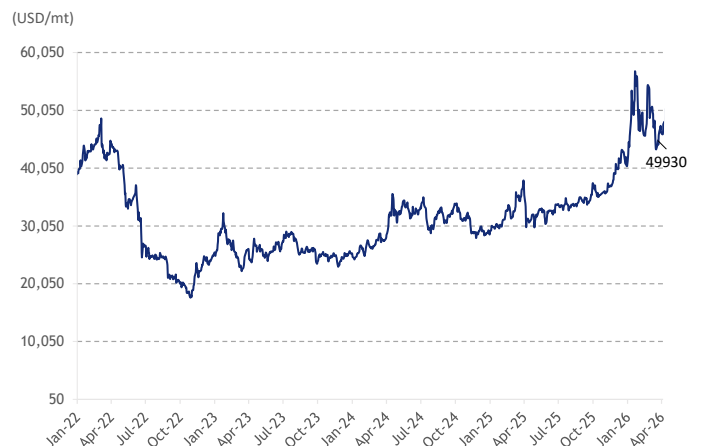
Exhibit 4. Tin Price