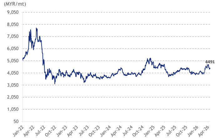
Exhibit 2. Palm Oil Price