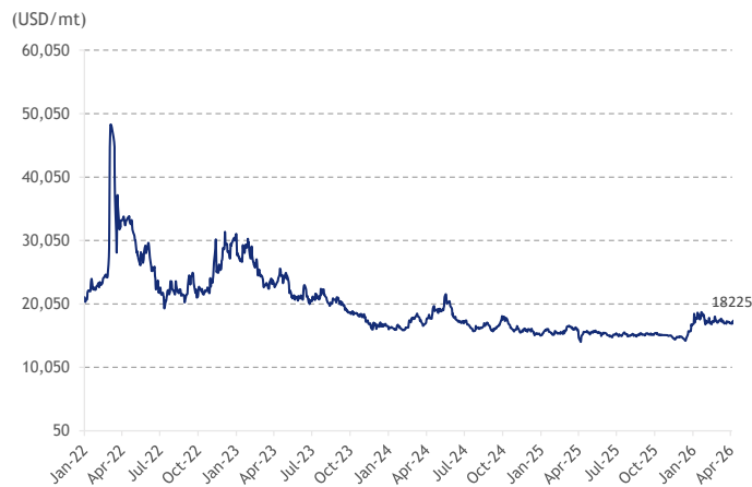
Exhibit 3. Nickel Price