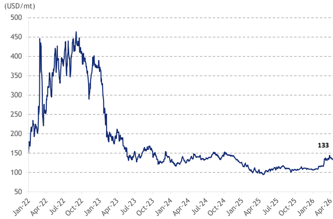
Exhibit 1. Coal Price